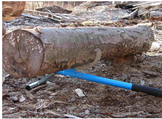
4. Log stand holding log