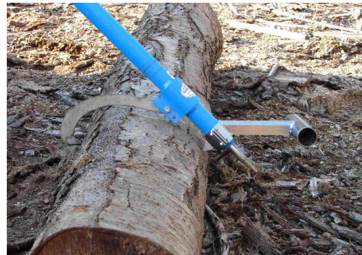
1. Set the hook (Peavey and log stand)