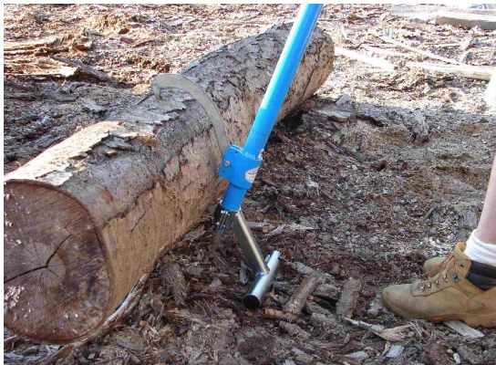
2. Peavey and log stand turning log